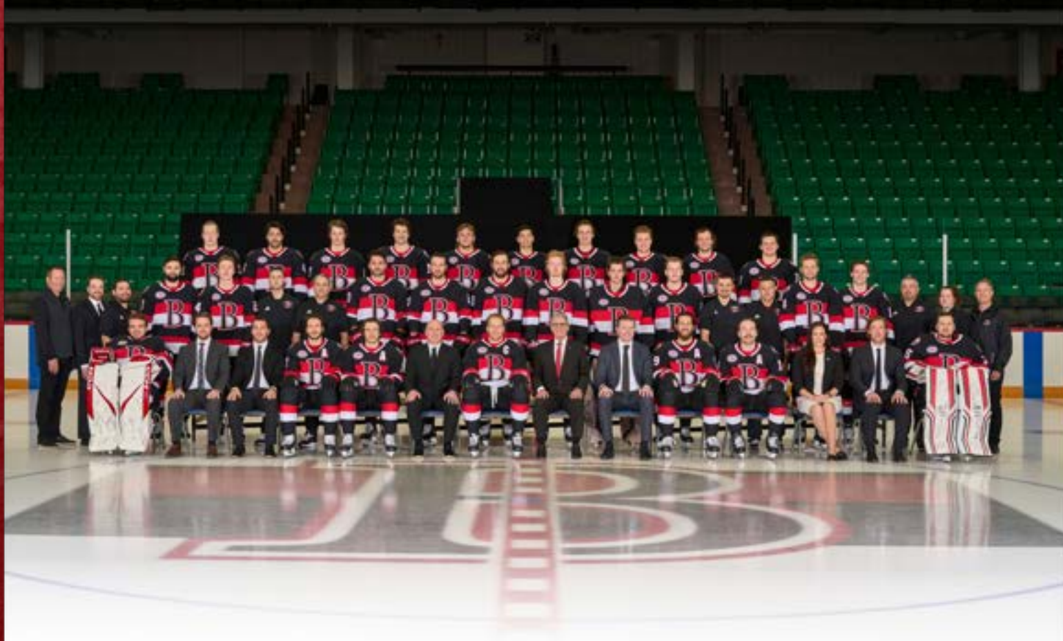
2022-2023 BELLEVILLE SENATORS HOCKEY CLUB